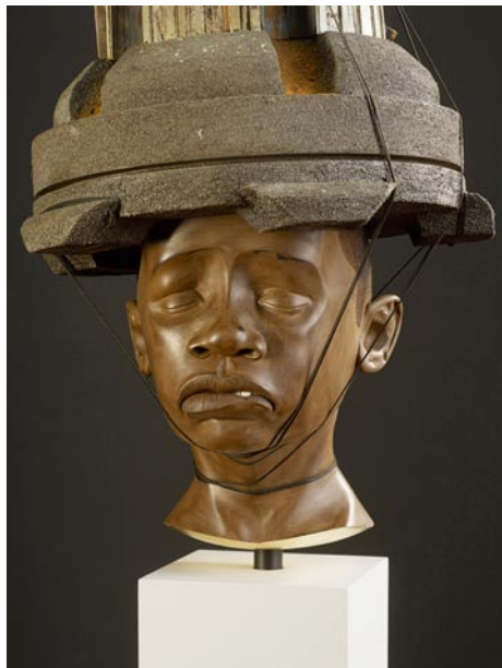
Dustin Farnsworth, The Understood Weight , 2013, Basswood, poplar, plywood, MDF, veneer, rope, steel, and polychrome, 42 x 13 x 13 in

The Burning Man Festival is a yearly gathering in Nevada's Black Rock Desert in which participants create a temporary city dedicated to community and art.