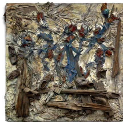
Thornton Dial, After the Burn , 2012, fabric, metal, wood, clothing and enamel on canvas and wood, 72 x 72 x 10 inches. Collection of the Souls Grown Deep Foundation, Atlanta.

Rather than presenting artists and their work through notions of marginality, Social Geographies generates discussions of subjective and shared experiences told through concepts of space and place. To this end, the exhibition engages viewers on multiple levels. Featuring 40 mostly large-scale works by American artists that represent space and place, the exhibition investigates visual ways of mapping such experiences through layered material objects, panoramic formats, cartographic views, chronographic vistas and depictions of visionary and vast worlds.