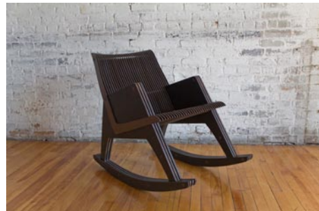
Nate Moren with Tandem Made , Topographic Rocker, 2012, Masonite, plywood, nylon spacers, hardware, 31 x 22 x 37 in

The Center's new 3-story home is situated in the heart of downtown Asheville's thriving arts, music, and restaurant scene. The building, circa 1912, originally served as a garage, machine and repair shop, and automobile showroom before housing the Asheville-born and craft-focused book publisher Lark Books. The Center and Ken Gaylord Architects/ Blackhawk Construction have revamped the space. Non-essential fixtures and temporary walls have been removed to make way from an expanded exhibition area and office space, all the while maintaining the building's historical aesthetic and integrity.