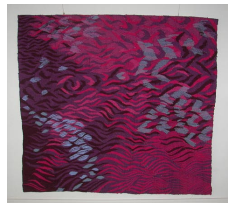
Work by Silvia Heyden

The Durham Arts Council in Durham, NC, is presenting Silvia Heyden & Edith London: Together Again , a landmark exhibition celebrating the creativity of two of Durham's most significant artists, on view in the SunTrust Gallery, through Feb. 28, 2014.