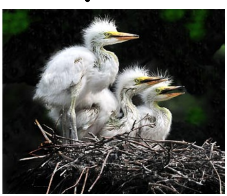
Work by Gene Furr

Furr became interested in wildlife photography and placed in the North Carolina Wildlife Magazine Photo Contest the last five years and in 2011 won the Grand Prize out of 4,500 entries. In 2012, he placed second out of 7,600 entries for the Defenders of Wildlife Photo Contest. In 1983, he