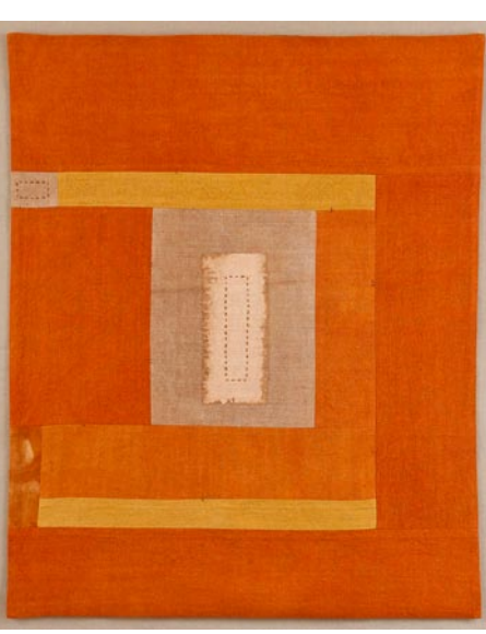
Work by Barbara Zaretsky

am moved to create art for everyday use. Functional textiles can enhance our lives in subtle yet powerful ways—from expressing who we are to communicating emotion."