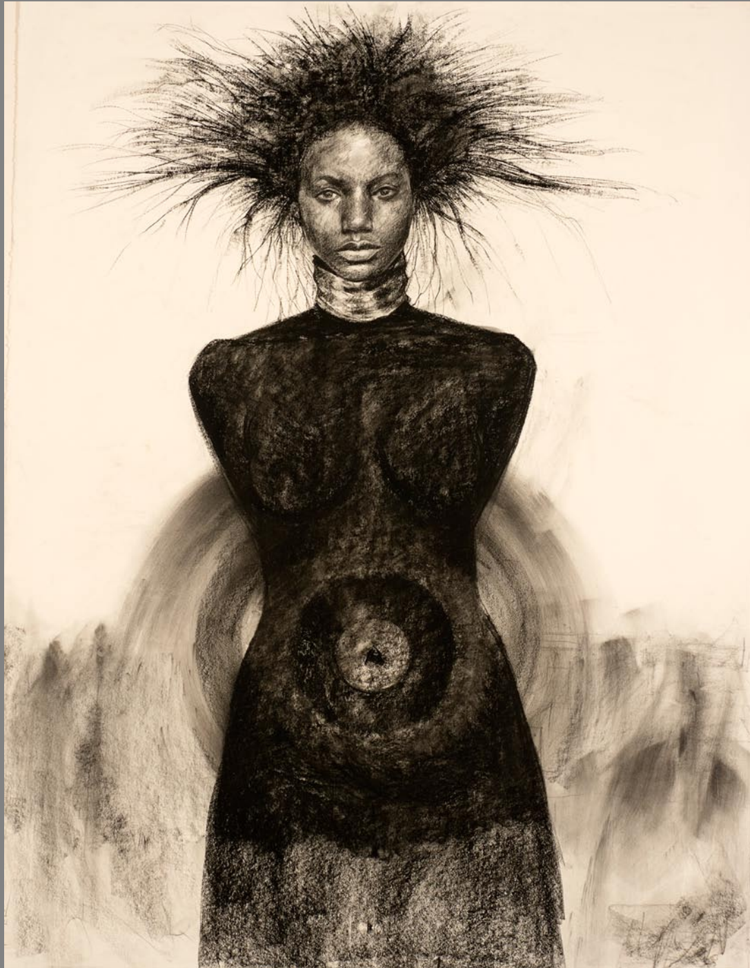
Target Charcoal, Torn Paper 54 x 40 inches

A PUBLICATION COVERING THE VISUAL ARTS IN THE CAROLINAS