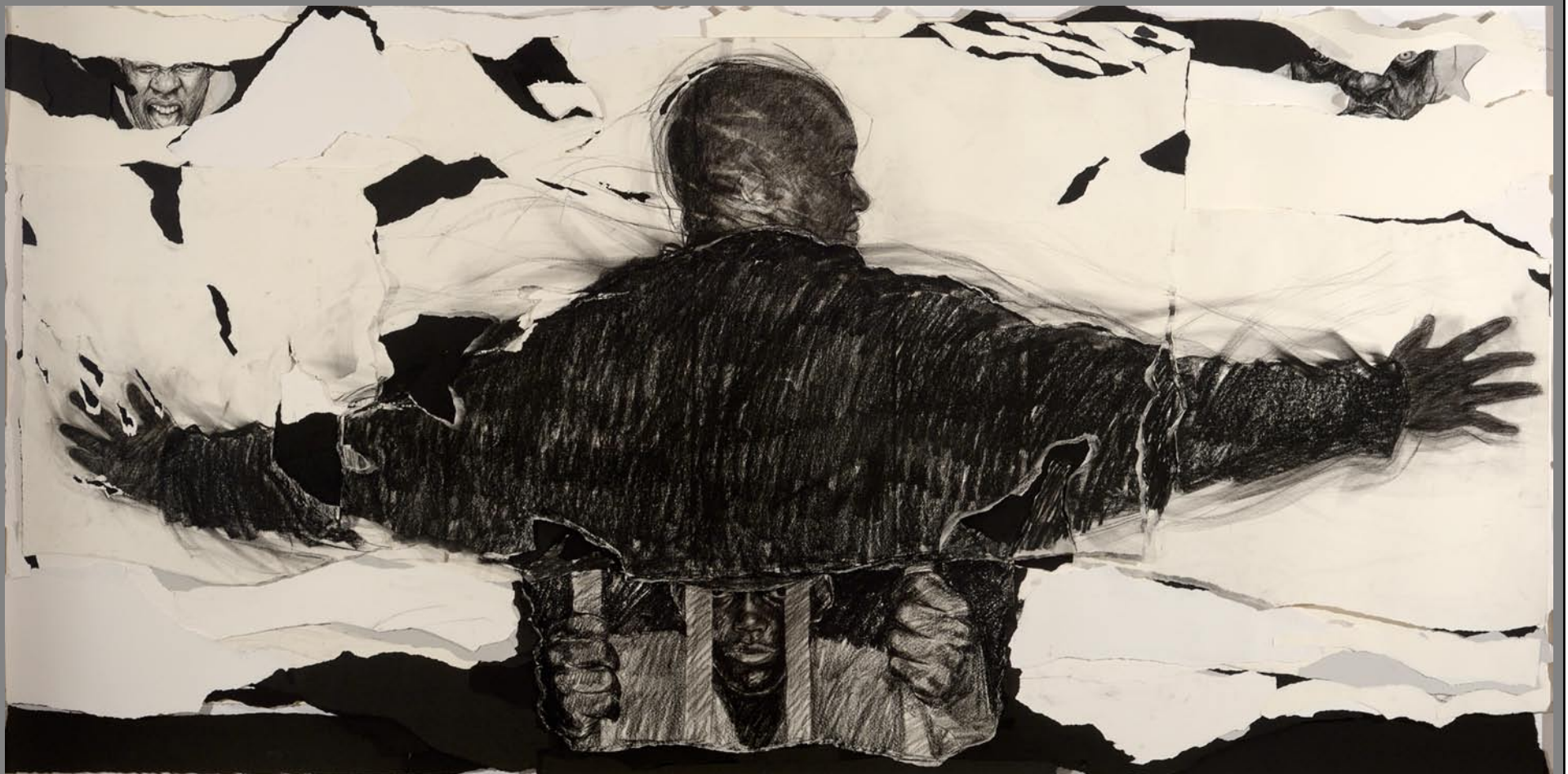
Hands Up (detail) Charcoal, Torn Paper 4 x 8 feet

The City of Charleston Office of Cultural Affairs presents Drawing from the Lifeline at the City Gallery at Waterfront Park in Charleston, South Carolina, from January 24 – March 1, 2015, featuring new and recent mixed media works by Tyrone Geter.