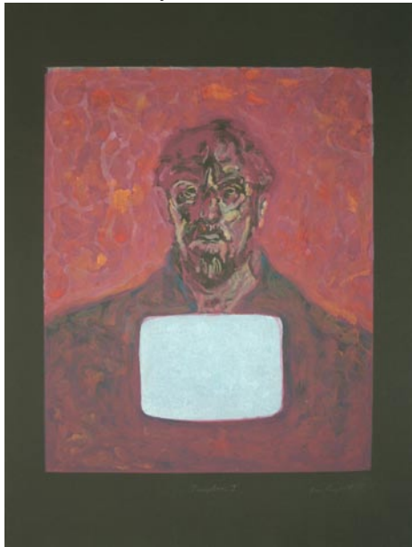
Work by Jim Campbell

Our policy at Carolina Arts is to present a press release about an exhibit only once and then go on, but many major exhibits are on view for months. This is our effort to remind you of some of them.