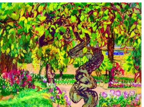
Work by Laurie Blum

While at the Museum guests are able to enjoy four other exhibits: Swim: An Artist's