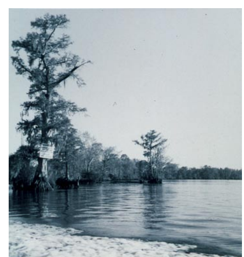
"Danger" Inlet Waterway by Vennie Deas Moore non-profit organization whose mission is

Curated by photo documentarian Vennie Deas Moore, the exhibit takes the viewer on a journey into the lives of individuals and families on Sandy Island, SC, one of three Gullah Geechee communities that remain accessible only by boat. The photographic collection, created in 1997, offers new interpretive text and historical artifacts that present an "insider's" unromantic view of a place and people seldom seen. It portrays the interconnectedness of culture, the value of work, a sense of stewardship of the land, and the symbiotic relation between the long time black and white cultures. "The exhibit documents an important story of our region," says Bob Jewell, President and CEO. "It provides a captivating snapshot of an aspect of the living culture of Gullah Geechee people."