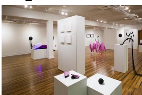
View of exhibit by Leah Mulligan Cabinum

The works in this exhibition are intended to mimic life's cyclical nature through an active exploitation of materials. Phases ranging from youth through maturity are referenced and aligned to environmental cycles such as those of the moon, flora, and reproduction. The interplay between seemingly contradictory elements creates balance - masculine and feminine, manmade and organic, and light and dark. Everything is related in some fashion. Like a circle everything loops, resonates and repeats. Naturally, one's perspective may shift, obscuring the connections from those less curious. The universality of our own evolution eventually becomes apparent to each of us, and