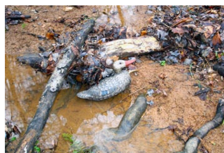
Work by Pringle Teetor

eration through visual imagery in paintings, photography, metal, fiber, glass, ceramics, and wood. It is a show for all those who appreciate Southern fiction and local art.