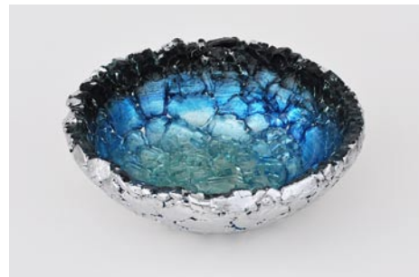
Work by Mira Woodworth

For further information check our NC Institutional Gallery listings, call the Council at 704/920-2787 or visit ( www.cabarrusartscouncil.org ).