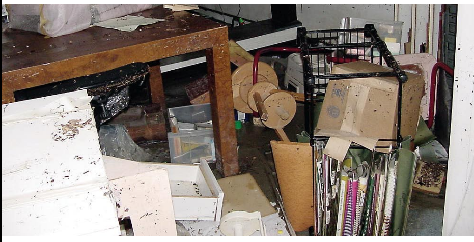
Artist Diane Falkenhagen's Texas studio — destroyed by flooding during Hurricane Ike, 2008

What would you do if you lost your work, your tools, your images, and a lot more to a flood? Metalsmith Diane Falkenhagen knows what five feet of contaminated saltwater