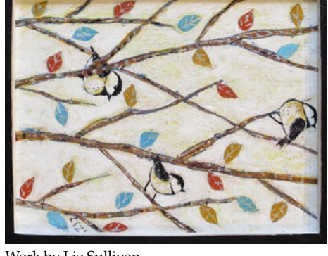
Work by Liz Sullivan

When creating pieces for this show, these artists, known for vast stores of creativity rather than training, often experiment with new ideas. This experimentation can lead to breakthroughs that