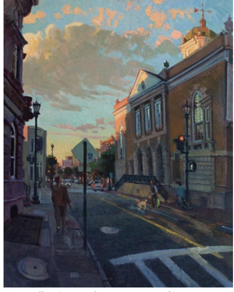
b. 1955); oil on linen; 24 x 30 inches; Courtesy of