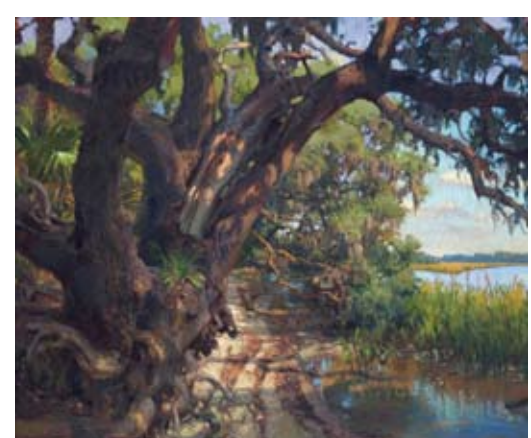
West Fraser A Southern Perspective