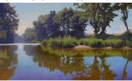
Work by Luke Allsbrook

ties, and preserve mountain artistic heritage. This project was supported by the