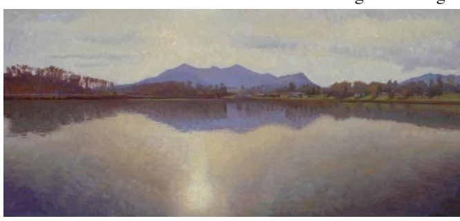
Work by Luke Allsbrook

scale versions painted in the studio. The paintings seek to capture a sense of place as well as the abstract beauty of light and color reflected in water.