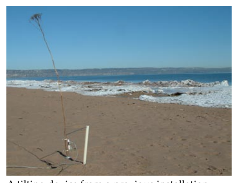
A tilting device from a previous installation by David Bowen

The installation, Tele-present Wind , consists of a series of 42 x/y tilting devices connected to thin dried plant stalks installed in the gallery and a dried plant stalk connected to an accelerometer installed outdoors. When the wind blows it causes the stalk outside to sway. The accelerometer detects this movement transmitting it in real-time to the grouping of devices in the gallery. Therefore the stalks in the gallery space move in real-time, in unison, based on the movement of the wind outside.