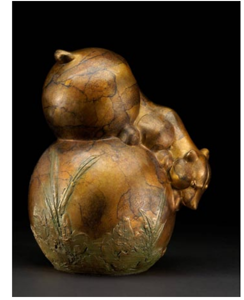
Work by Time Cherry

For further info check our SC Institutional Gallery listings, call 800/849-1931 or visit (www.brookgreen.org).