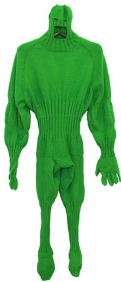
Mark Newport. American, 1964-, Ribbes , 2009, Hand knit acrylic, buttons. Courtesy of the artist.

free admission to both locations of The Mint Museum on Saturday, Mar. 10 and Saturday, Mar. 17, while Mint members can receive a 25 percent discount on the purchase of "Sleeping Beauty" tickets. For more information on "Sleeping Beauty," visit ( www.ncdance.org ).