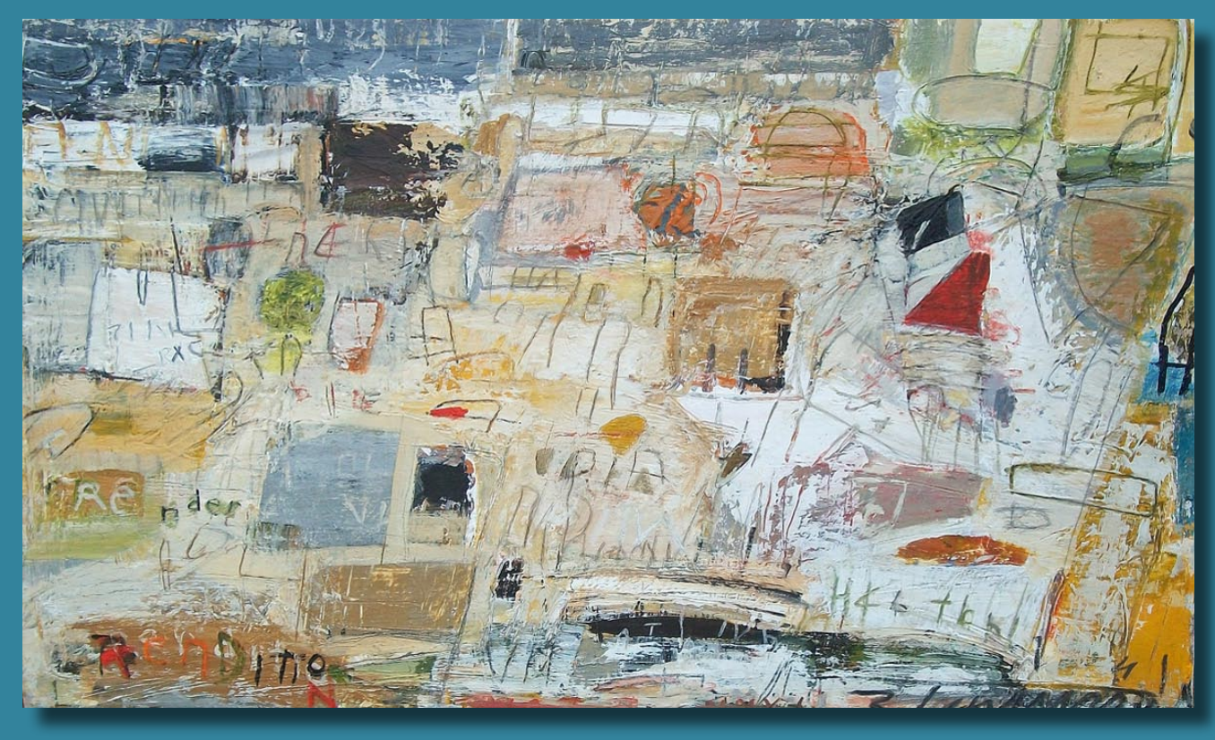
Renditions by Ralph Turturro