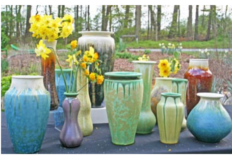
Works from Bulldog Pottery

focus on their carefully crafted and glazed vase forms to celebrate beautiful spring flowers, especially the queen of all - the ubiquitous daffodil, whose many varieties bloom from mid-January to early May.