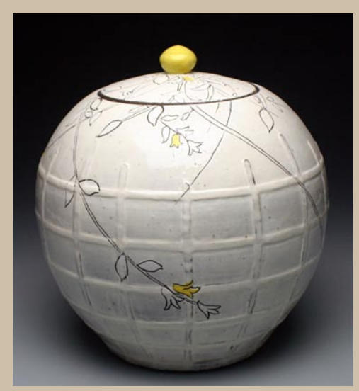
Work by Ben Carter

(http://www.carterpottery.blogspot.com/2009/05/welcome-totales-of-red-clay-rambler.html).