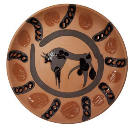
Bull by Pablo Picasso, 1957, © 2014 Estate of Pablo Picasso / Artists Rights Society (ARS), New York

"Picasso is an artist that most people recognize, and have strong opinions about, and this is the type of show that people will travel to see," said Gallery Director Silvana Foti. "A Picasso show is something that we