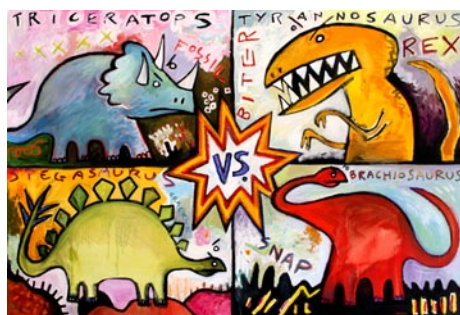
Work by Keith Norval

"I wanted to make the work really cartoony, bright and loud to emphasize the size and scale of the dinos," Norval commented.