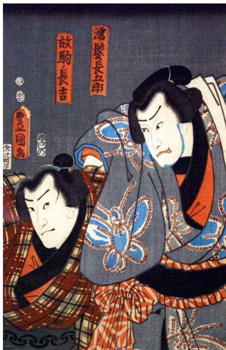
Bancho Sara Yashiki, Kunisada (Toyokuni III), c. 1850; gift of the Utagawa-Ha Jimukyoku Society of Japan and the Japanese Consulate in Atlanta.

Taiko Japanese Drumming, front lawn of the historic Chancellor's Residence. In ancient Japan, drums were sounded in rituals, festivals and on the battlefield to encourage bravery and signal attacks.