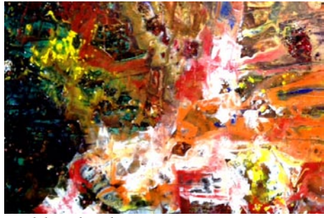
Work by Eduardo Lapetina

Three members of the Hillsborough Gallery of Arts have let their imaginations go with a show entitled Flights of Fancy . Each with different mediums; glass, photography and acrylic painting they have created a magical experience of color and form.