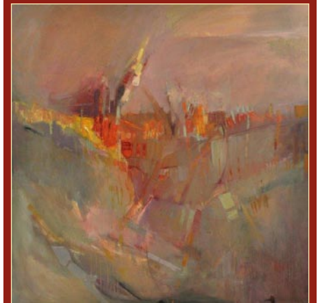
Daybreak, oil on canvas

www.LauraLiberatoreSzweda.net Contemporary Fine Art by appointment