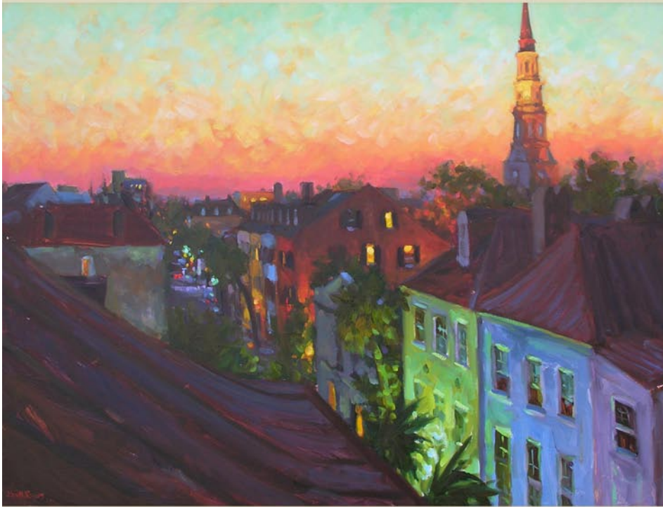
St. Philip's Dusk 30x40