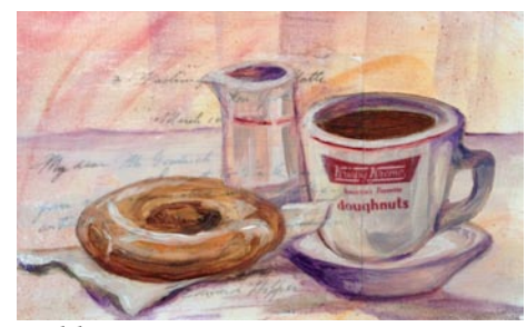
Work by Betti Pettinati-Longinotti

For further information check our NC Institutional Gallery listings or visit (www. Artworks-Gallery.org).