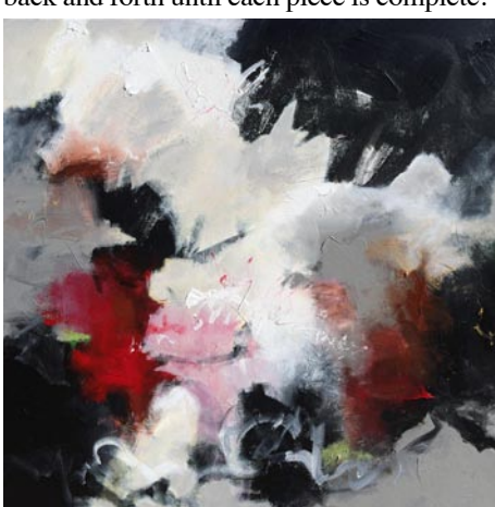
Work by David M. Kessler

Kessler has this to say about the exhibition, "The paintings in the show all began with marks applied to the canvas with black paint in an effort to generate a composition. Then as I begin to apply the color the 'Conversation' begins. How do I treat the black marks? Do I leave them as-is? Do I cover them? Do I use washes across them so they are semi-visible? Should the paint be transparent? Opaque? Thus the conversation back and forth until each piece is complete."