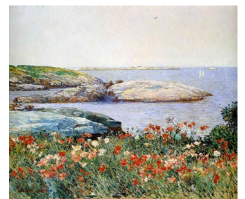
Childe Hassam, "Poppies, Isles of Shoals", 1891, oil on canvas, 19 3/4" x 24", National Gallery of Art, Washington, Gift of Margaret and Raymond Horowitz, 1997.135, Image courtesy National Gallery of Art

"This spring the NCMA will be illuminated by Childe Hassam's breathtaking impressionist landscape paintings