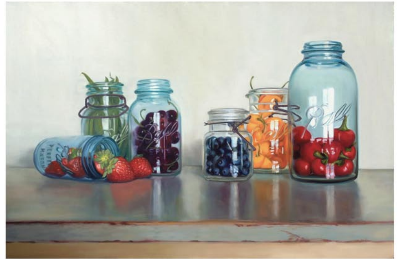
SALLY THARP, THE HAVES , 24x36, ACRYLIC ON CANVAS