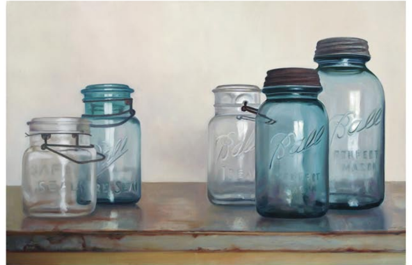
SALLY THARP, THE HAVE NOTS , 24x36, ACRYLIC ON CANVAS