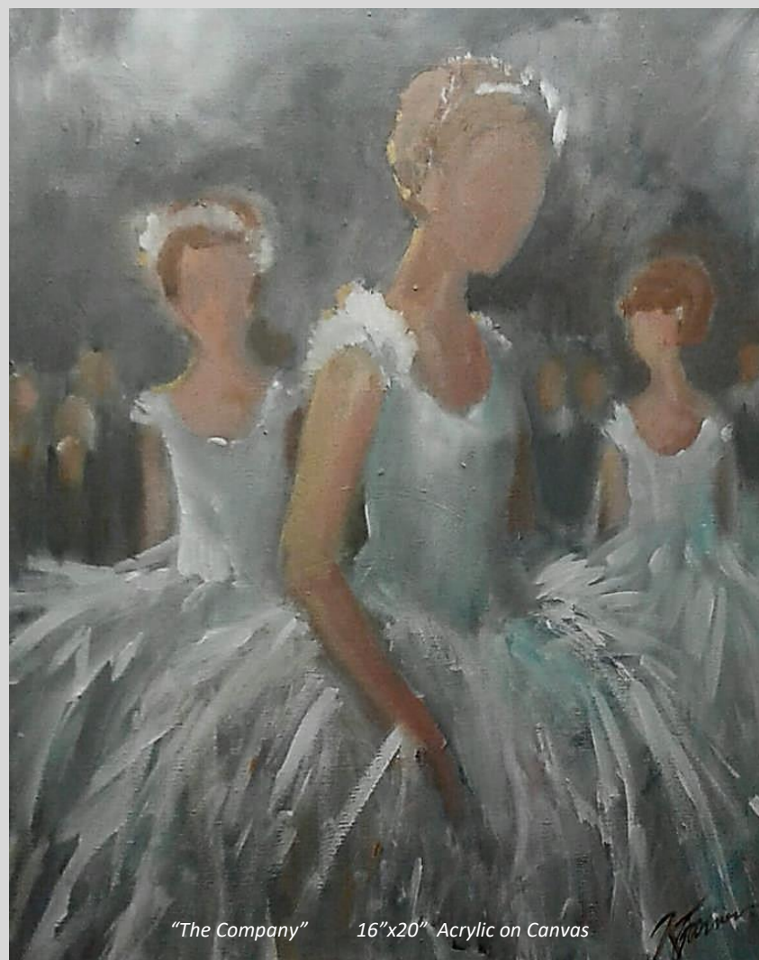
"The Company" 16"x20" Acrylic on Canvas

THE SANCTUARY AT KIAWAH ISLAND 1 SANCTUARY BEACH DR, KIAWAH, SC 29455 843.576.1290 WWW.WELLSGALLERY.COM