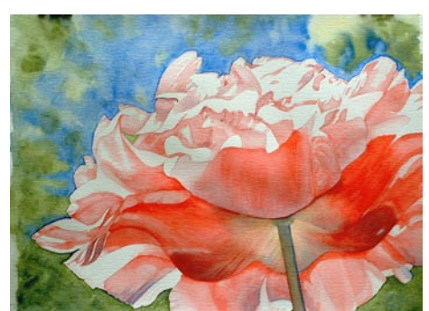
Work by Mary Decker

The Blue Ridge Watermedia Society group has grown steadily since it was organized in the early 1990s. Meetings of the Blue Ridge Watermedia Society take place at 6:45pm on the second Tuesday of the month at the Haywood Community College's Continuing Art & Education Building. Members paint in a variety of media, not just watercolor as the name suggests. Members share tips and experiences, and can take advantage of demonstrations and workshops taught by local