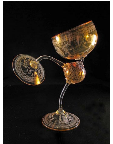
Work by Mathieu Grodet

Ongoing - Featuring original, contemporary fine art by 21 regional artists. Hours: Fri.-Sun., 9:30am-3:30pm and most weekdays or by appt. Contact: 828-776-2716 or at ( http://www.310art.com/main/ ).