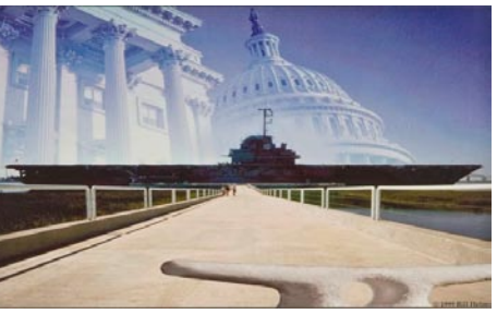
Work by Bill Helms

Helms was probably the youngest Page 8 - Carolina Arts, April 2013