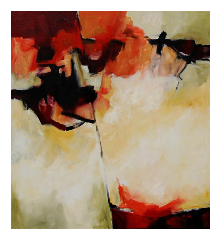
Fracture Oil on Canvas, 72 x 66 inches

NINE QUEEN STREET CHARLESTON, SC 843.853.0708 INFO@ANGLINSMITH.COM WWW.ANGLINSMITH.COM