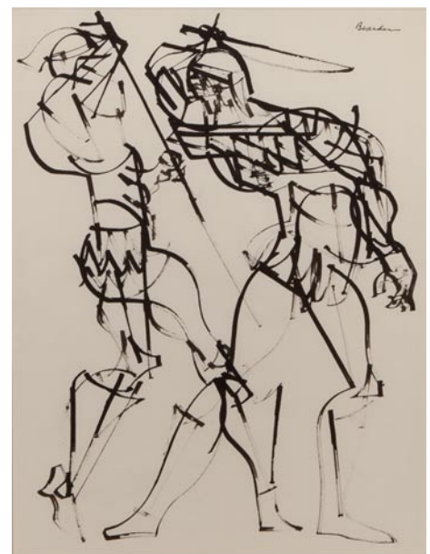
Sword Fighter, 1948, by Romare Bearden.

Greenhill promotes the visual arts of North Carolina by engaging a broad