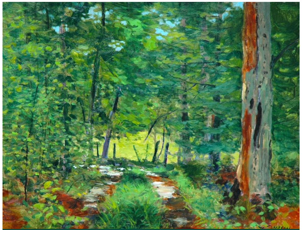
Carolina Logging Road

continued above on next column to the right