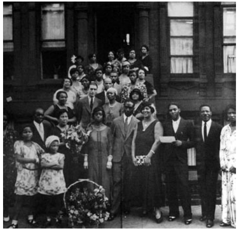
Family Group Outside Brownstone, 1920s'.

Beaufort Art Association Gallery,913 Bay Street, across the street from the Clock Tower, Beaufort. Ongoing - New works by more than 90 exhibiting members of the Beaufort Art Association Gallery - exhibits and featured artists change every six weeks. In addition to framed paintings in a variety of media, the gallery offers prints, photographs, unframed matted originals, jewelry, sculpture, ceramics and greeting cards. Hours: Mon.-Fri.,10 am-5pm. Contact: 843/521-4444 or at (www.beaufortartassociation.com).