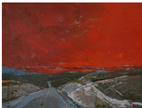
Work by Marlise Newman

"However, what resonates is the painterly way Newman works, applying her oils to imply rather than mimic the landscape.