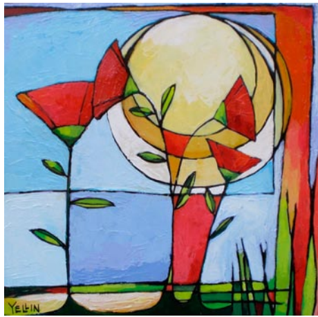
Work by Michele Yellin

The Hillsborough Gallery of Arts is owned and operated by 22 local artists and represents these established artists exhibiting contemporary fine art and fine craft. The Gallery's offerings include acrylic and oil paintings, sculpture, ceramics, photography, textiles, jewelry, glass, metals, encaustic, enamel, and wood.