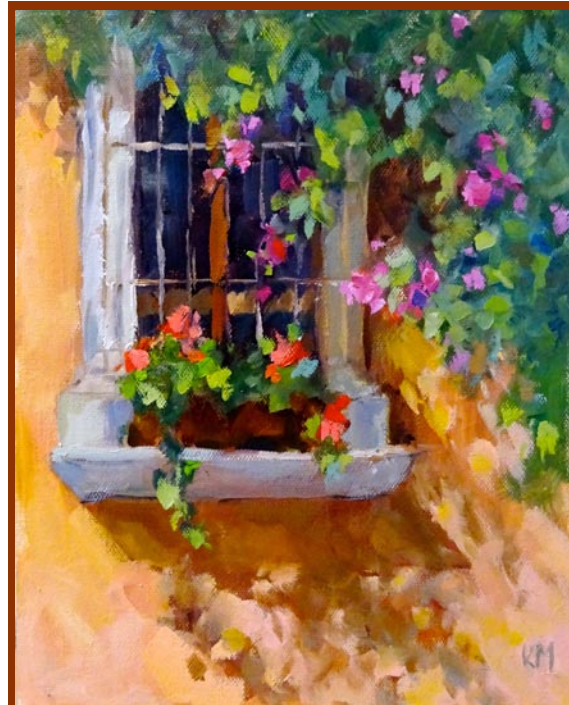
Window Shadows oil 8 x 10 inches

Karen Meredith Fine Art Impressions of Color and Light