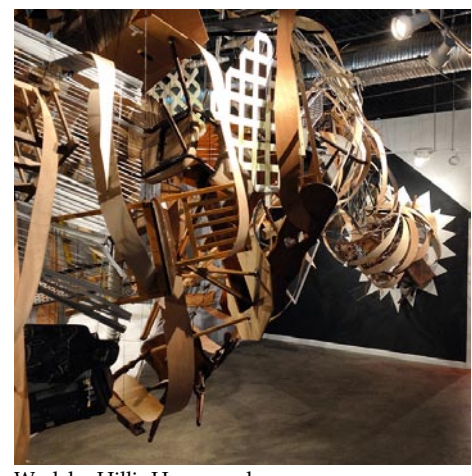
Work by Hillis Hammonds

Indie Grits will also feature a Mini Cine, a cinema in a portable shipping container. The pop-up theater will be located on Boyd Plaza throughout the festival and the public