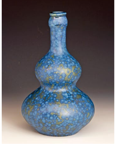
Work from Bulldog Pottery

Bulldog Pottery is located 5 miles south Page 32 - Carolina Arts, April 2015