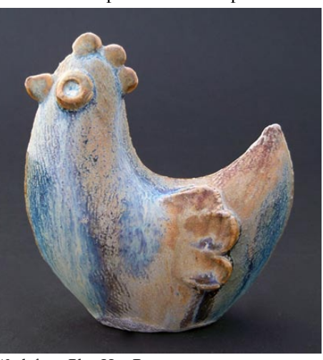
Work from Blue Hen Pottery

Celebrate Spring in Seagrove, NC, Apr. 18 and 19, 2015, with 43 pottery shops. Participating shops will hold kiln openings, open houses, demonstrations, studio tours, door prizes and more. Each shop will do something different to celebrate. The Spring Celebration Guide, which can be picked up at any participating shop, includes color photos and a map.