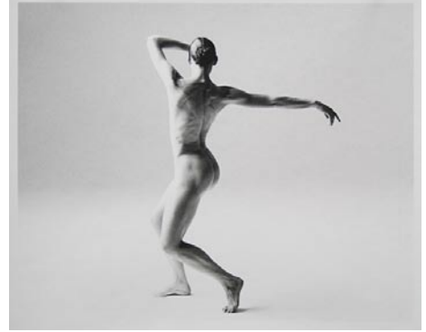
"Dancer" from Nudes and Dance Series.

On the Other Side of the Lens: The Photography of Leonard Nimoy will feature 43 photographs covering more than 30 years of his work. In addition to the "Eye Contact" series, other photographs that will be on exhibit come from his "Early Work", "Self Portraits", "Black & White" series, "Shekhina", "Classic Nudes" and "Dance" series