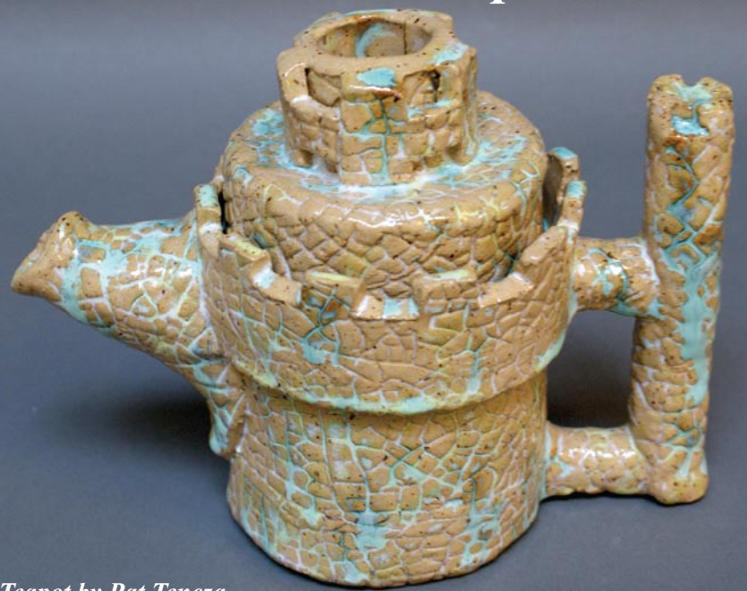
Teapot by Pat Tencza

323 Pollock Street • New Bern, NC 28560 Hours: Monday - Friday 10:00 am - 6:00 pm Saturday 10:00 am - 5:00 pm • 252.634.9002 www.fineartatbaxters.com