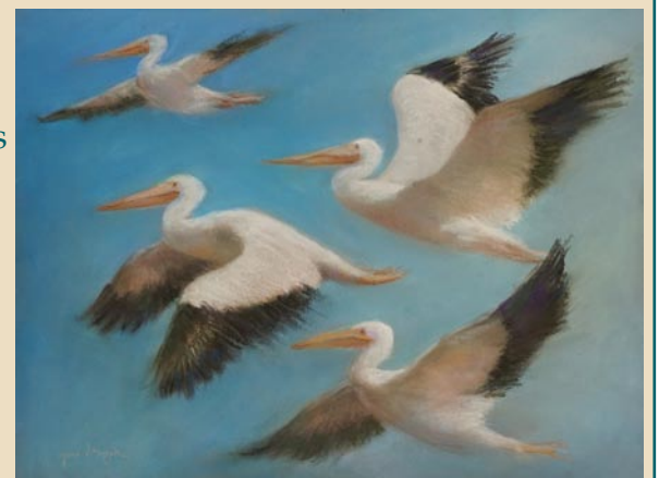
Jane Staszak, Off We Go , pastel, 15 x 20 inches