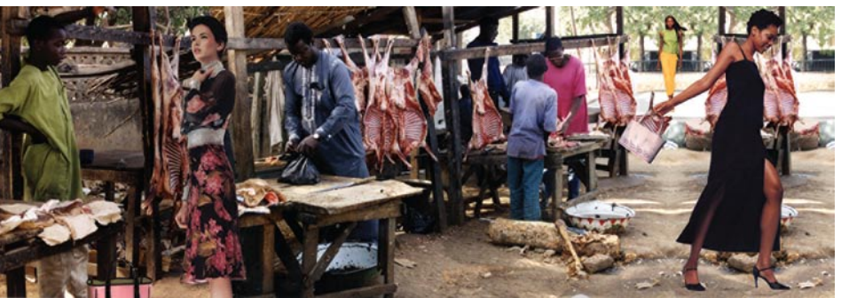
Fatimah Tuggar, "At the Meat Market", 2001.

to nostalgia - which is always available to us, too."