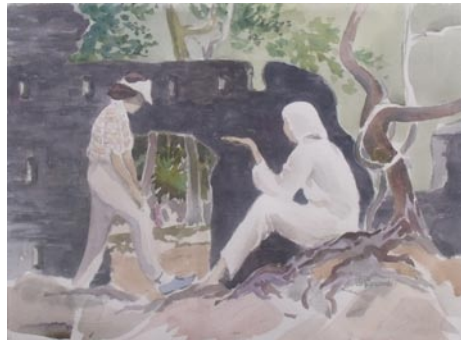
Work by Guy Lipscomb

Lipscomb's earliest works are primarily watercolor depictions of Charleston homes and lowcountry landscapes. Lipscomb later lost interest in realism and began improvising with transparent inks and watercolor in 1985. By 1994, he was working exclusively in acrylic, using it to create transparent layers and increasingly abstract images. When asked about this switch from realism to non-representational work, Lipscomb stated "the representational work didn't keep me excited. The abstract work is very difficult for me. They don't come easily. With these you don't know what's going to happen next. That's the fun part for me: the risk taking. You're reaching all the time. People constantly say, 'When are you going to paint some pretty pictures again?' I tell them, 'Never.'"