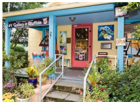
A view from outside Pluff Mudd Art Gallery

This co-op gallery opened in the old Mercantile Building in 2002 under the name, "A Guild of Bluffton Artists". Four years later it became Pluff Mudd Art and moved across the street to its present location in the little yellow cottage at 27 Calhoun Street. The gallery features 23 local artists from Bluffton, Beaufort and Hilton Head and offers a variety of mediums: watercolor, oil, and acrylic painting, photography, jewelry, pottery, wood arts, fiber art, glass, sweet grass baskets, and metal. Little wonder this gallery has been voted the best and most eclectic gallery in