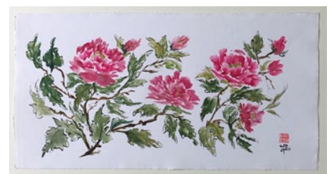
Work by Barbara Rizza Mellin

Mellin uses traditional Chinese bamboo brushes that allow her to create the thinnest lines and broadest areas of color with just one brush. The blacks are derived from Chinese or Sumi ink sticks that she grinds with water onto an ink stone, producing various viscosities of ink. Other colors come from Chinese watercolor paints that are richer in tone and more