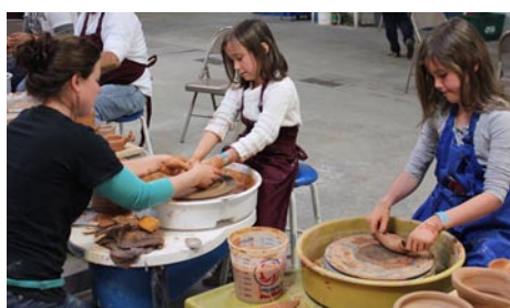
Firefest offers many opportunities for guests of all ages to tap into their creativity.