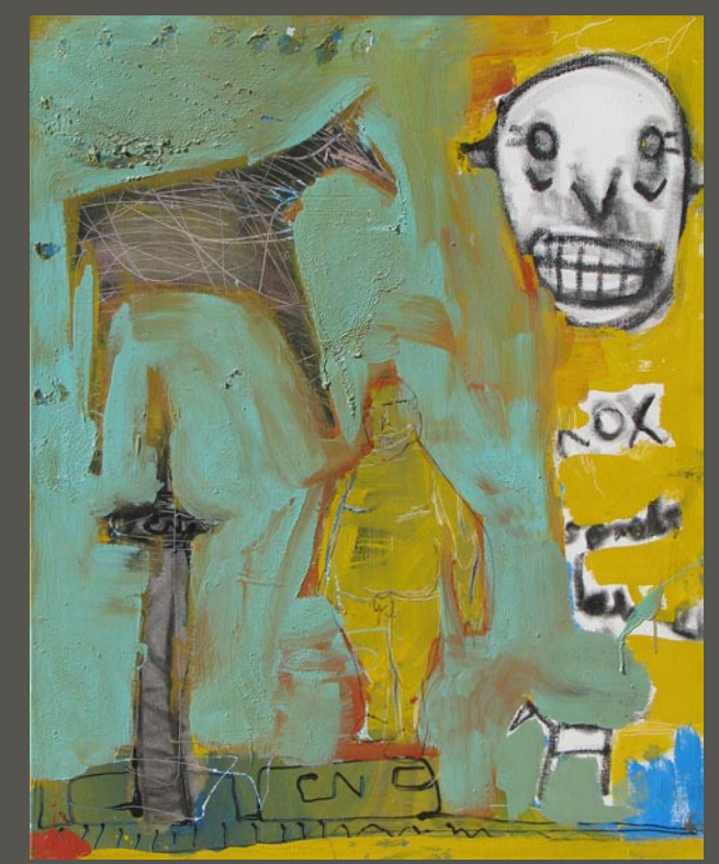
XONON Oil on Canvas 31 x 36 inches Casey McGlynn