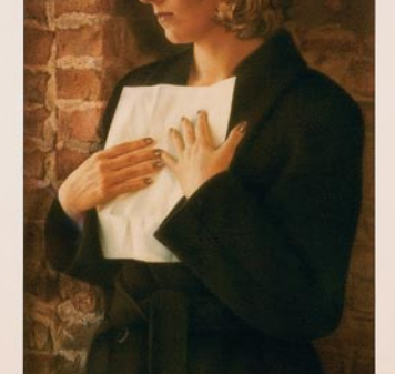
Best of Show 2010