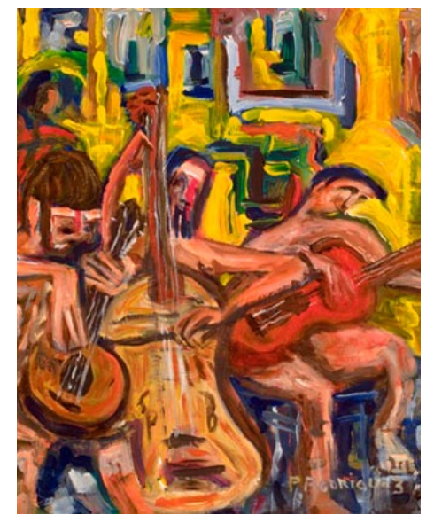
Work by Pedro Rodriguez

Center in Walterboro, SC. The exhibit is on view: May 1, 9am-pm; May 2-6, 9am-5pm; and May 7, 9am-noon.