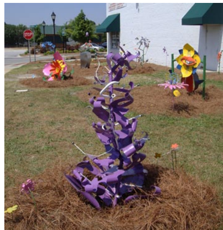
View of installation

The artists have spent several weeks learning to create delicate curves and forms out of durable steel. They have immersed themselves in the processes and problems related to public art. Each artist developed a concept, created a public art proposal, engineered an anchoring system