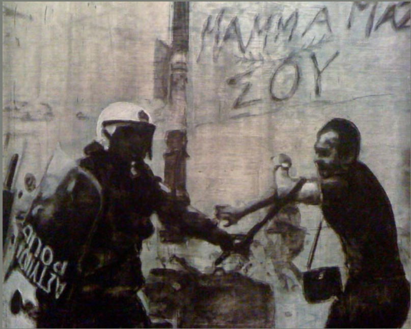
Image: Michael Dickins, Greece 2011 (detail) , 2012, graphite, charcoal, oil pastel on wood panel

The multi-media installation PreOccupied focuses on the conflicts and uprisings of the past year in Greece, Libya, Syria, Egypt, Bahrain and New York, using a balance of digital and material processes which allowed the artist to create pieces that are both expressive and engaging. Influenced by the snapshot and documentary imagery, Michael Dickins' interactive installation is a commentary on the disconnect between the consumer of American mass media and global conflict.