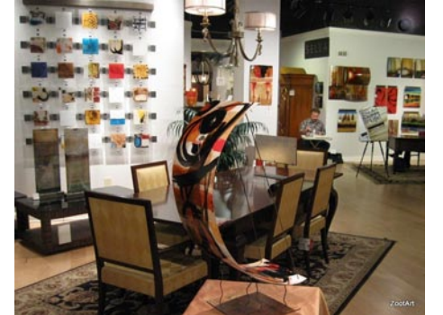
Works by Zoot

For Zoot the splendor of nature and wonder of the world leaves a lasting impression that outlasts any one artistic movement. His style is not derived from specific period in art history, but rather 3-Dimensional storytelling. His unique style can be described as an all-embracing balance of converse yet connected imagery. Whether it's a graceful acrylic landscape, an abstract field or a 3-dementional metal wall hanging, Zoot's creations will evoke a feeling of visual energy.