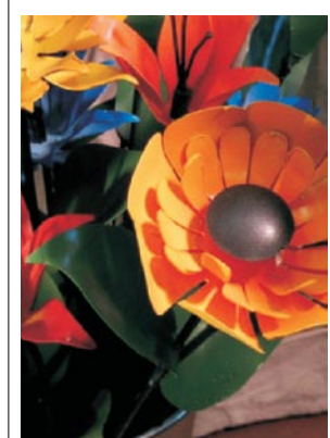
Plant stakes by Steven Cooper

Garden Art! Paintings Hand crafted Plant stakes Sculpture Bird houses Wind Chimes