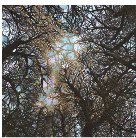
Work by Mariannic Parra

In the Distance of the Dream – Works by Mariannic Parra, on view May 1 - 20, 2012. Following in the footsteps of French impressionist artists such as Claude Monet, Paul Signac, and Georges Seurat, Mariannic Parra seeks to explore dimensions of light. But, like more contemporary artists such as Dan Flavin and Walter di Maria, Parra's works move beyond the impressionists by using light as a medium. Her featured body of work includes landscape thematic paintings using natural materials, like volcanic sand and coal, and contemporary materials, such as plexiglass.