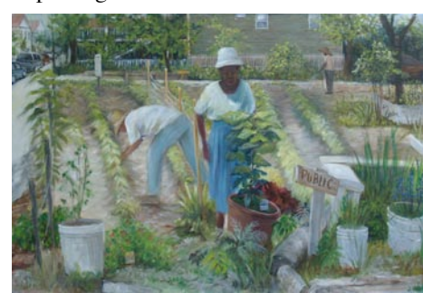
Work by Lori Starnes Isom

continued above on next column to the right Mermaids & Merwomen in Black Folklore – 6th Annual African American Fiber