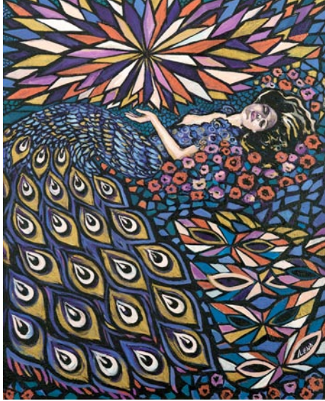
Official Festival Design Image by Elena Barna

Now in its 30th year, the North Charleston Arts Festival will take place May 4-12, 2012. The nine day event draws thousands of residents and visitors each year and is one of the most comprehensive arts festivals in the state, highlighting national, regional, and local artists and performers in the areas of Dance, Music, Theater, Visual Arts, Crafts, Photography, Media Arts, and Literature.