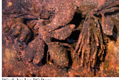
Work by Joe Walters

Walters' intriguing animals and insects, at times separate, other times presented in a tableau or a large installation, are reminiscent of the past - relics, abandoned objects, something forgotten or ignored. Walters' works either appear to be rusted metal or are bluish, "ash gray, the pieces looking a bit like something frozen in time and place by a volcanic eruption," as described by arts writer Jeffrey Day. Walters puts the creations together in site-specific installa-